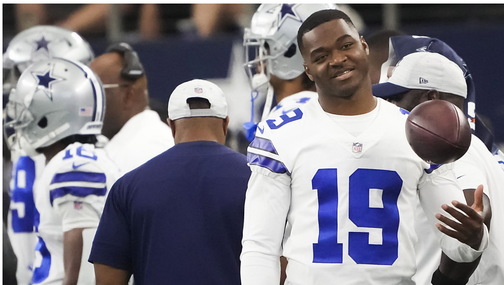
Dallas Cowboys wide receiver Amari Cooper tosses a ball on the sidelines during the first half of a preseason NFL football game against the Jacksonville Jaguars at AT&T Stadium on Sunday, Aug. 29, 2021, in Arlington.